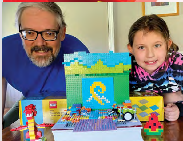
Special thanks to our cover art builders: Erich and Leah Asperschlager