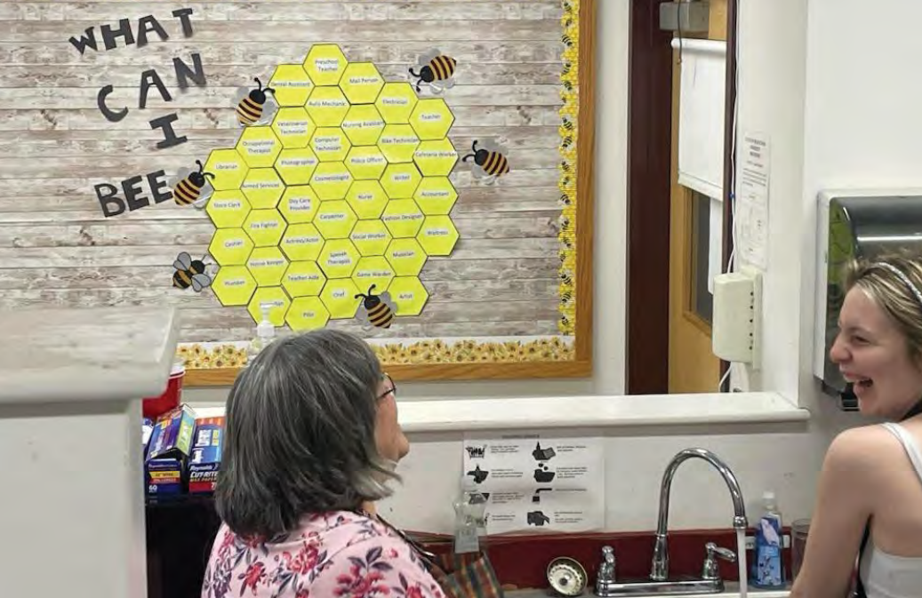
Mastering life skills are worth smiling about!