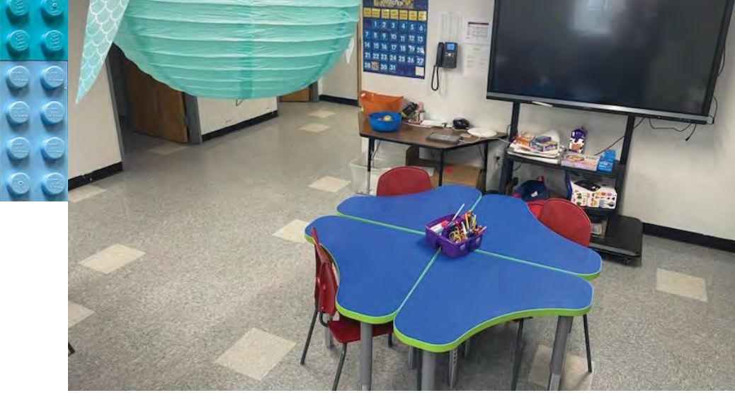
The new classroom tables help students with special needs toggle into a smaller group and the new seating easily accommodates this adjustment.